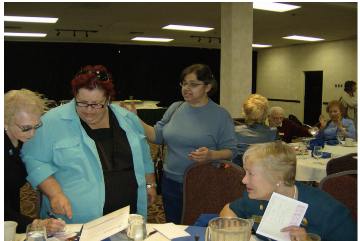
Members use the time for activism as well as a social time.