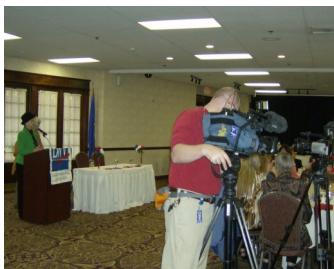
League’s speakers are generating media attention.